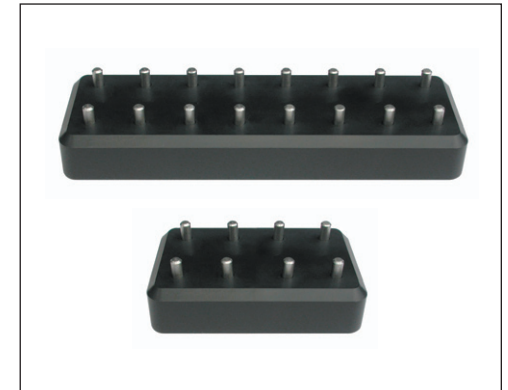
Table top luer slip vacuum tips holder with non-slip rubber feet. Posts will accommodate up to sixteen of our luer slip vacuum tips.